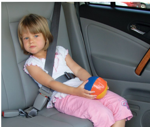
No booster— WRONG seat belt fit

The booster seat lifts the child up to help the lap belt fit properly, low and snug across the hips. The booster seat also helps the shoulder belt to fit right, which is snugly across the mid chest and resting on the shoulder.