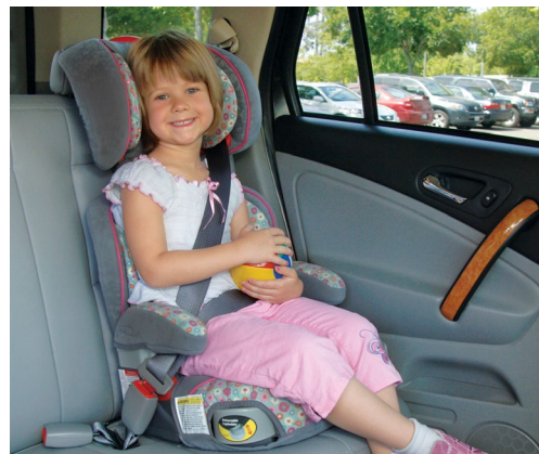
With booster seat— RIGHT seat belt fit

Seat belts are made to fit adults, not children. Booster seats keep children safer in a crash by lifting them up so the seat belt fits right. Always use a lap and shoulder belt with a booster seat.